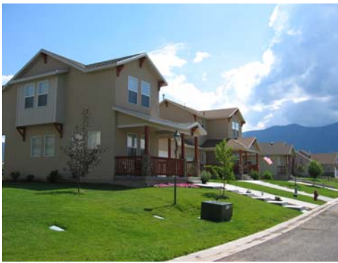
12 Affordable housing units built by MCHT in North Bench Farms

(MCHT) is a 501(c)(3) non-profit corporation located at 1960 Sidewinder Drive, Suite 107, Park City, Utah. Founded in 1993, MCHT is based on the belief that a safe affordable home is often a family's first step toward economic self-sufficiency. MCHT addresses the dual problems of housing affordability and availability on three fronts: acquisition and new construction of affordable housing, direct assistance in securing housing and needed basic services, and education and advocacy to promote housing policy.