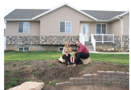
Mutual Self Help Housing home, built in Kamas